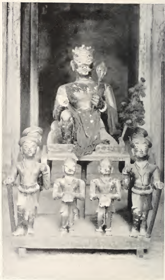
YAMA, GOD OF DEATH, BORNE BY HIS MESSENGERS.